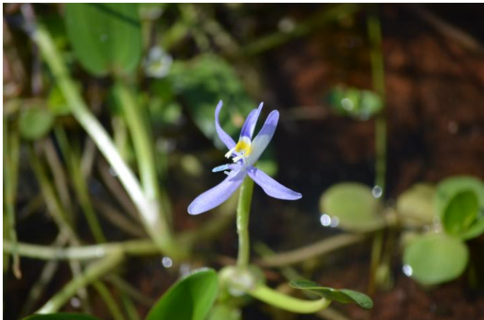
A Mud Plantain (Heteranthera limosa) in Blue Mounds State Park near Luverne, Minn.