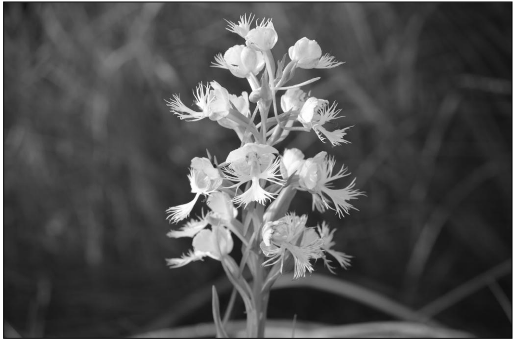
Western Prairie Fringed Orchard at Touch The Sky Prairie near Luverne, Minn..

4:30 a.m.: After four hours of sleep, I head up Highway 75 toward Touch The Sky Prairie, coffee in hand and a little Hank Williams on the radio. I ask myself if this is normal behavior or am I completely dysfunctional and ready for the bug house? I reach the refuge in complete darkness and silence and start my half mile walk to the center of the largest tract of land. I want to experience this place coming to life at sunrise. I reach the highest vantage point on the refuge and dig out my camera gear. A