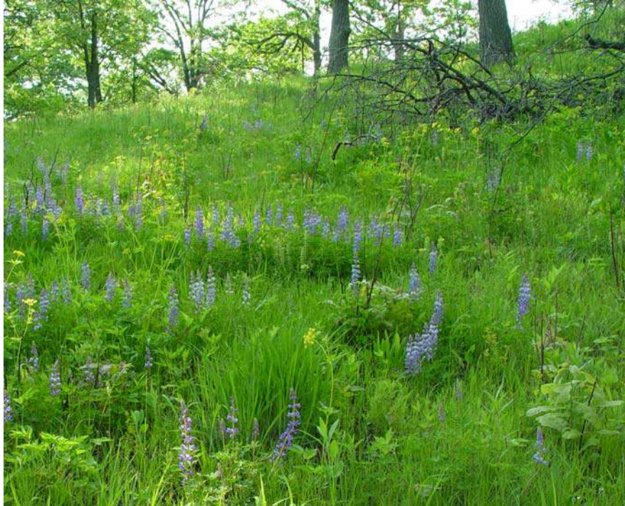
Lupine covers a hillside at the Sugar River Savanna.

three guided hikes will be offered each year. Hike details to come in the TPE field trip flier or on the web site.