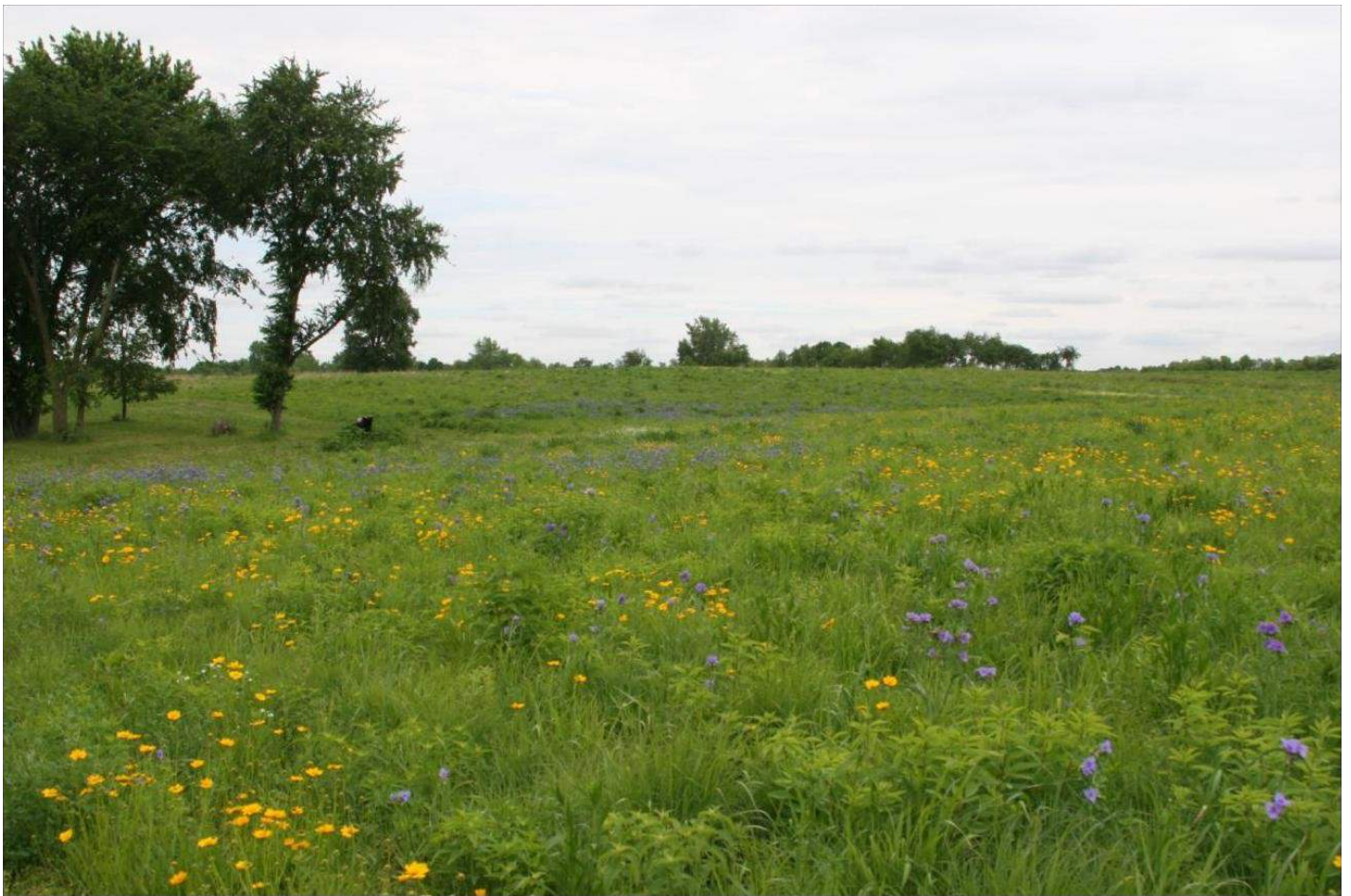
Wildflowers bloom at the Layton Easement. See story on page four.