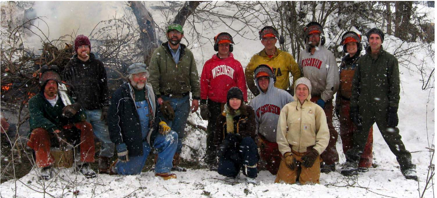
Prairie Bluffers and other Wisconsin DNR volunteers braved the snow to clear Stauffacher Unit, near Albany, Wisconsin (See article on page 10).

NIPE has a 50 gallon Tumbledrum mixer that we are willing to part with. It is electric and can be used to mix and/or thrash seed. The original cost (in 2000) was $1,125. But if you need the machine, we will consider any offer. To make an offer, contact Jim Rachuy (jr.TPE@verizon.net or 815-947-2287)