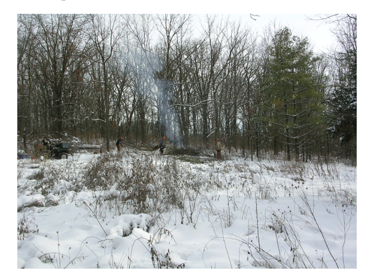
Expanding a prairie remnant called the Glade with the help of The Prairie Enthusiasts last winter.