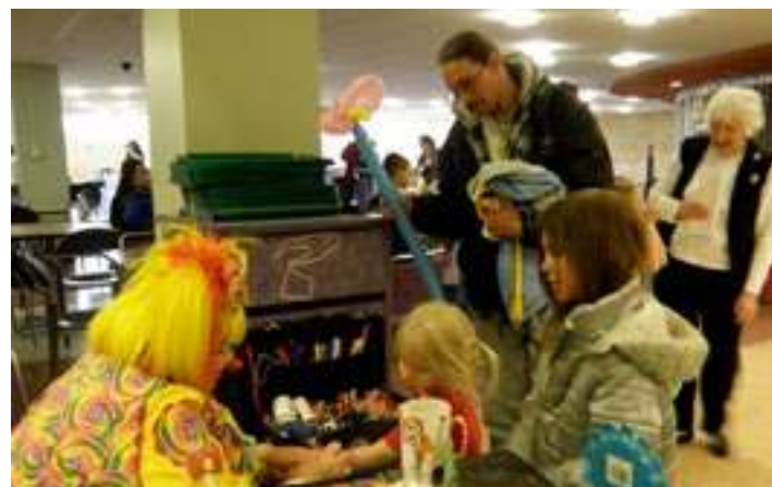
Scene from the highly successful childrens' program.

For only the third time, a track for families and kids was included in the conference program. Co-sponsored with The Water Resource Center, this track featured a day-long series of family-friendly topics. This free event had over 300 children participate over the course of the day and the Many Rivers Chapter is thinking about making this an annual event.