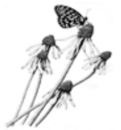
Regal fritillary