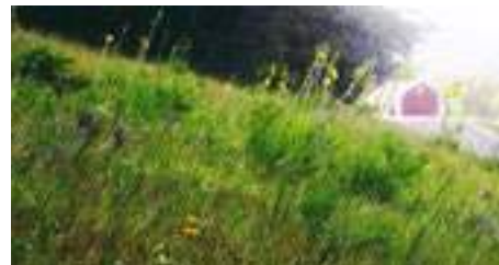
Feist Prairie

This 25 year long project is a fine example of what I believe the Prairie Enthusiasts stand for - a life-long commitment to conservation, protection and restoration of the last of our tallgrass prairie heritage. Nurturing trust and providing educational opportunities for landowners and the public is a foundation of our desire to leave our environment better than we found it.