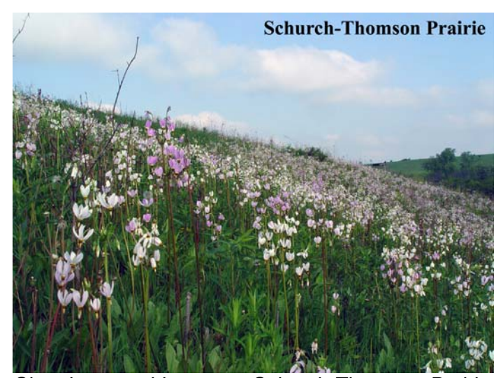
Shooting star blooms at Schurch-Thomson Prairie.

Even with this level of diversity, the preserve is still very much a work in progress. Significant renovation and restoration has been started, but much more is planned to bring back the land's former glory of prairie, oak savanna and prairie streams and wetlands on a landscape scale.