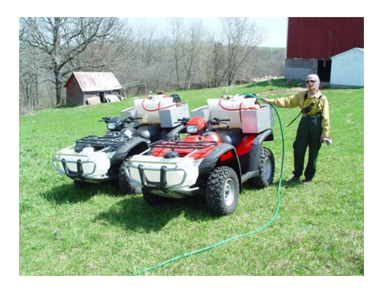
Newly customized ATVs.

The ATVs were used on two dozen burns this spring. This mechanized equipment will make our burns far more secure and will allow us to burn more challenging and larger areas in woodlands, savannas and grasslands. These burns improve and increase habitat for turkeys and protect rare and declining natural areas. The ATVs will also be used to apply herbicide, plant seed and other land management work. Thank you to the Wisconsin DNR for recognizing the importance of the work we do on the land.