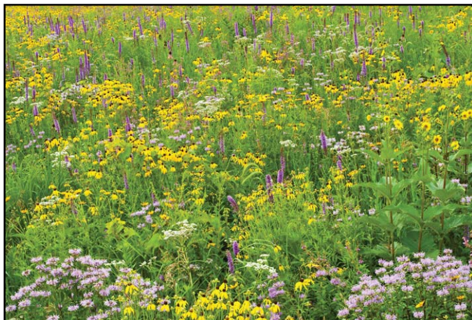
This photo of the Schurch-Thomson Prairie by Erik Preston was a finalist in the 2012 TPE Photo Contest.