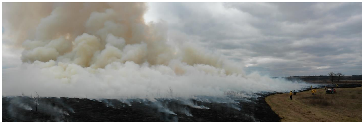
A ring fire nearing completion, showing convective heat drawing all fire to the interior. Conducted by volunteers of The Prairie Enthusiasts in Green County, WI.

Ring fire is a term for a sequence of ignitions that ultimately surround the burn unit with fire on all sides, and the various ignitions are purposely conducted and timed so that all fires draw inward at completion.