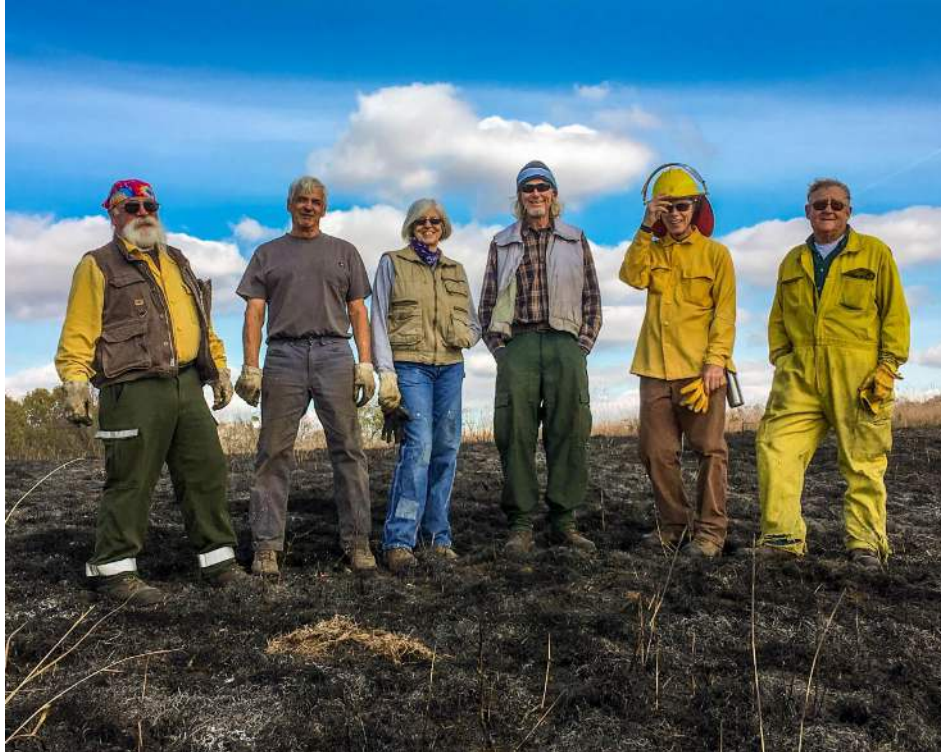
Photo of Prairie Bluff burn crew