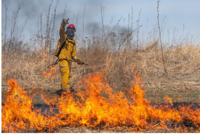
Photo of prairie burn