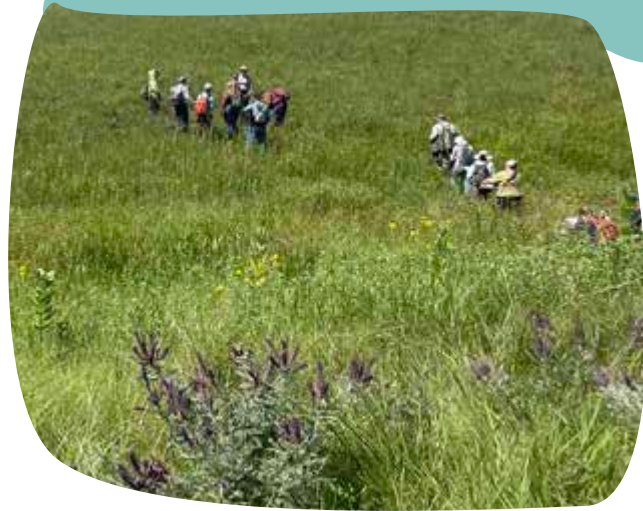
Prairie Enthusiasts enjoying a class in the prairie.