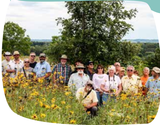
Chapter members enjoying the blooms on Avon Ridge.